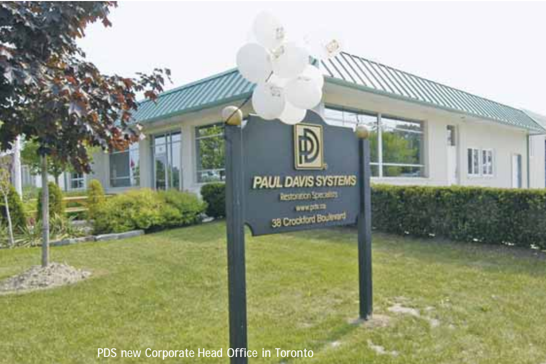
PDS new Corporate Head Office in Toronto