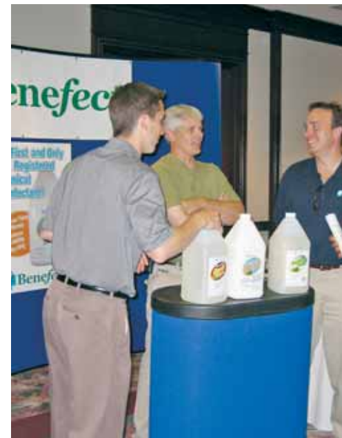
PDS Franchisees discuss new products at the Saturday's trade show.

ware. For those Franchisees who have not tackled this software yet, the Assured Software Consultant commented, "I don't want to tell you to build an arc before the storm, but the storm is coming!" Meaning this new efficient approach to packing-out and salvage is rapidly becoming the expected procedural approach by insurers.