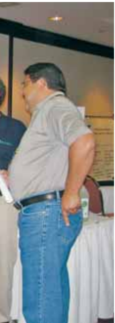
the Benefect booth